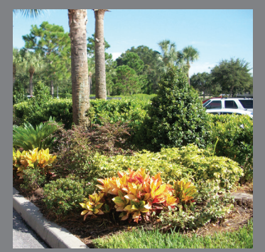
Kimco's new landscape designs incorporate native plants and efforts to reduce soil erosion and water use.

The Solar Energy Industries Association<sup>®</sup> recently ranked Kimco's solar energy program as among the largest of U.S. real estate companies.