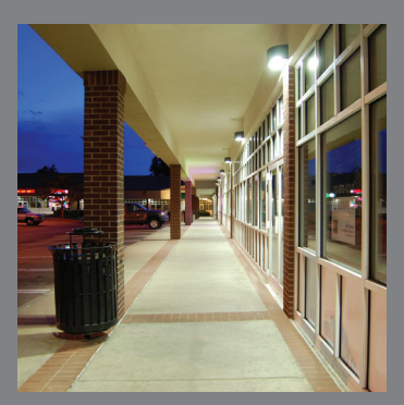
Kimco installed energyefficient upgrades to lighting systems at over 200 properties over the last three years.

Kimco is committed to reducing the environmental impact of our shopping centers. We are making sustainable improvements to common areas, and encourage tenants to adopt sustainable operating practices within their leased spaces.